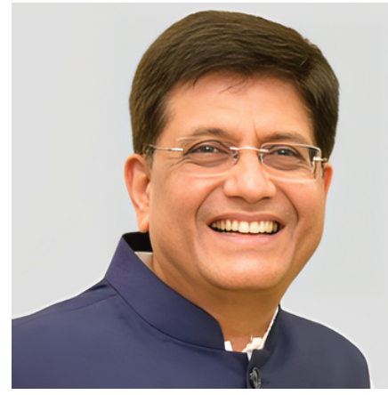
Shri Piyush Goyal Hon'ble Minister of Minister of Commerce & Industry