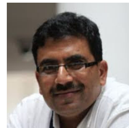
Shri Dnyaneshwar Patil, IAS, Development Commissioner, SEEPZ, Special Economic Zone, Mumbai.