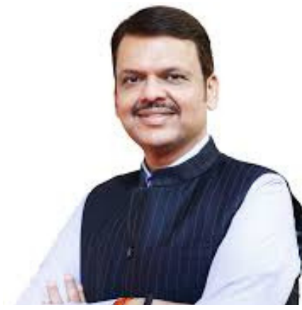
Shri Devendra Fadnavis Chief Minister of Maharashtra