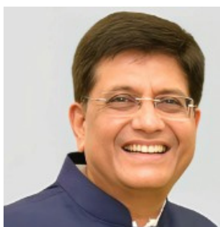
Shri Piyush Goyal

Hon'ble Minister of Road Transport, Highways