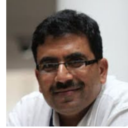
Shri Dnyaneshwar Patil, IAS, Development Commissioner, SEEPZ, Special Economic Zone, Mumbai.