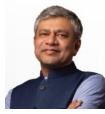
Shri Ashwini Vaishnaw

Hon'ble Minister of Minister of Commerce & Industry