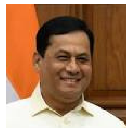
Shri Sarbananda Sonowal

Hon'ble Minister of Ports, Shipping and Waterways