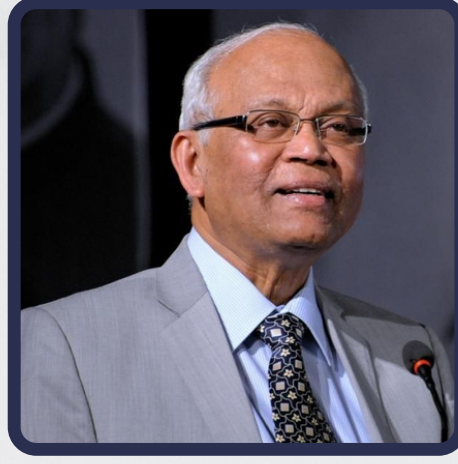
Dr. Raghunath Mashelkar, Former Director General, Council of Scientific & Industrial Research (CSIR)