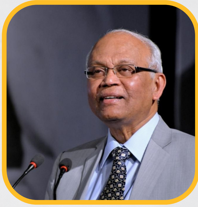
Dr. Raghunath Mashelkar, Former Director General, Council for Scientific and Industrial Research (CSIR)