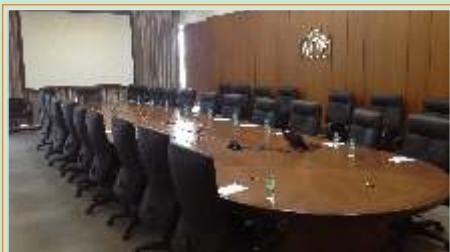
Conference Room: Capacity upto 40