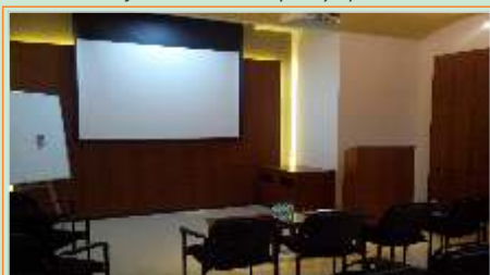
Seminar/Training Room: Capacity upto 35