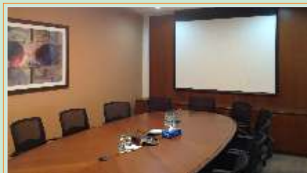
Meeting Room: Capacity upto 16