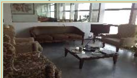
Lounge : Capacity upto 8