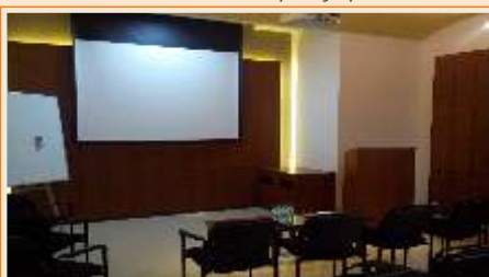
Seminar/Training Room: Capacity upto 35