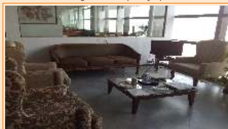
Lounge : Capacity upto 8

For bookings, contact: C.B. Juvekar 61200200 (B), 9869314614(M), cbj@bombaychamber.com