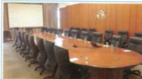
Conference Room: Capacity upto 40

For booklet contact : um@bombaychamber.com