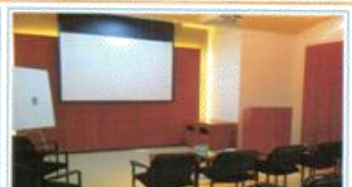
Seminar/Training Room: Capacity upto 35

Meeting Rooms for Rent | For bookings, contact: C.B. Juvekar 61200200 (B), 9869314614 (M), cbj@bombaychamber.com