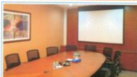
Meeting Room: Capacity upto 16