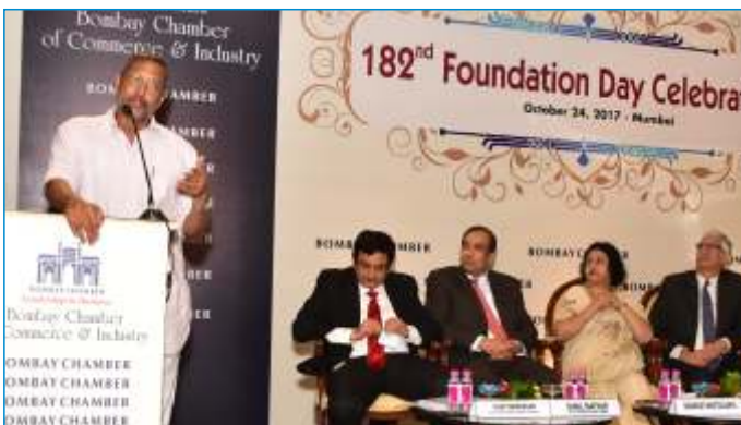
Padma Shri Mr. Nana Patekar addressing the members.