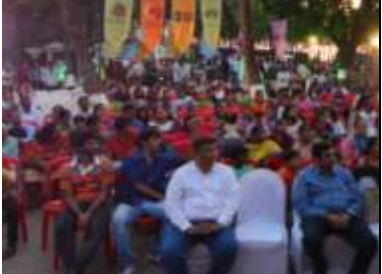
View of Participants